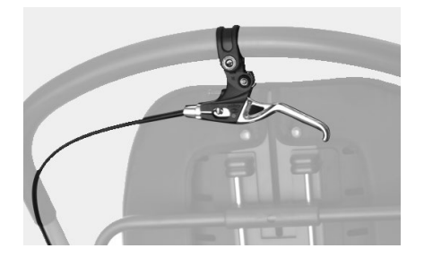
905 Hand brake