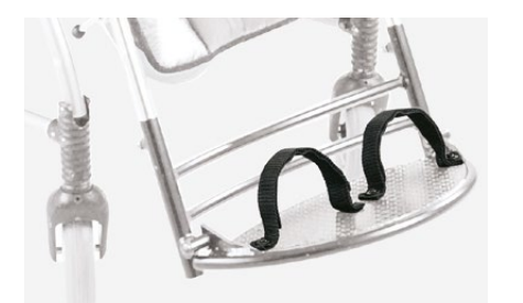
827 Foot straps