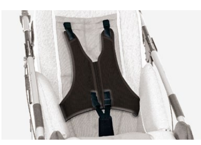
903 Five point vest harness