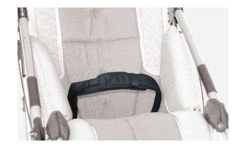
894 45° pelvic belt