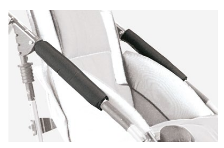
844 Side protecting covers