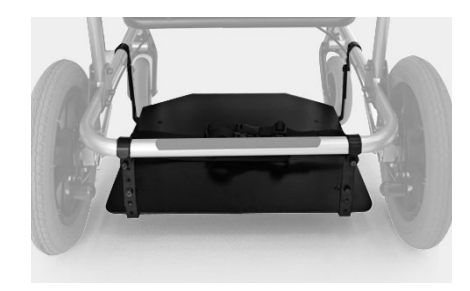
911 Vent tray