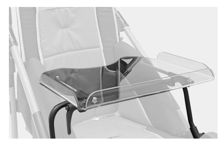
824 Transparent tray with recess.