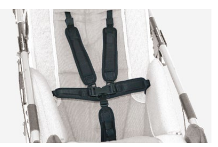
906 Five point harness