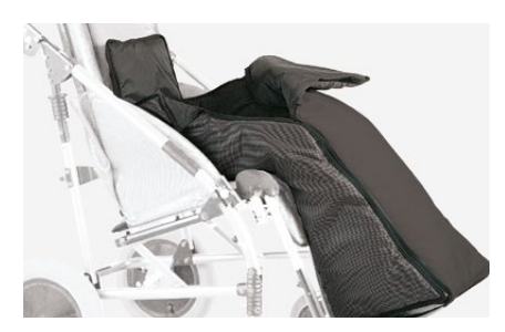
818 Thermal cover