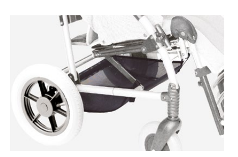
858 Net basket for 869 base