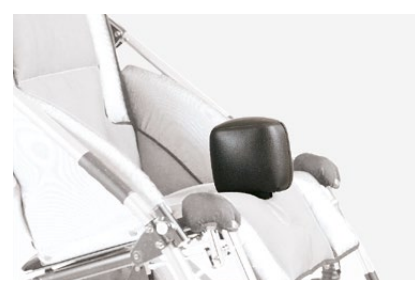
834 Abduction block adjustable in depth.