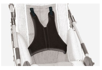
853 Vest harness