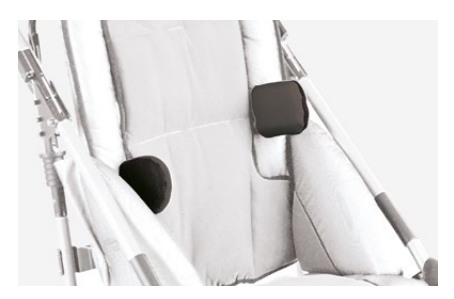
838 Lateral supports adjustable in height and width.