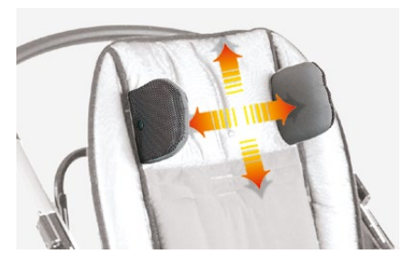
852 Headrest with parietal supports adjustable in height and width.