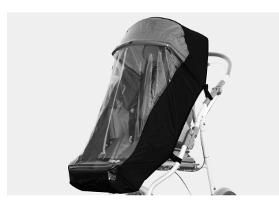
825 Rain cover to be fixed to the 819 canopy.