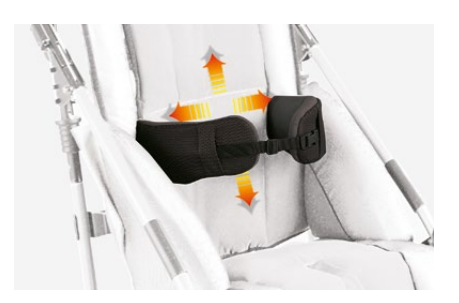
868 Wrappable and flexible trunk supports Adjustable in height and width.