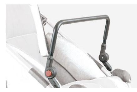
839 Front handle