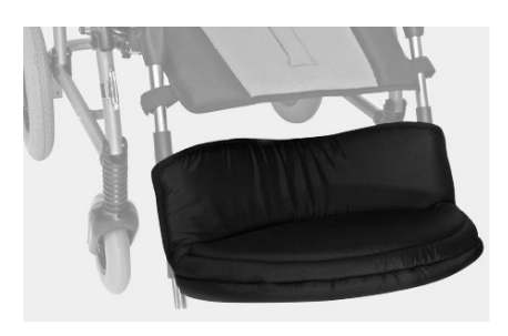
892 Covering for footrest