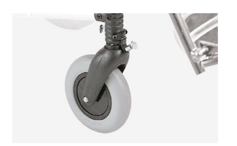
812 Directional locks for front wheels